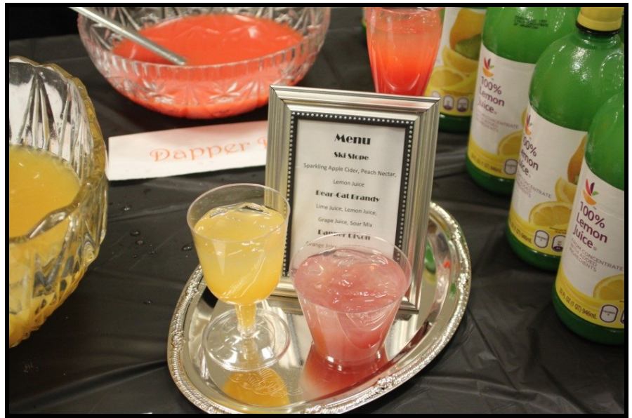
Mocktails at Roaring 20's Night!