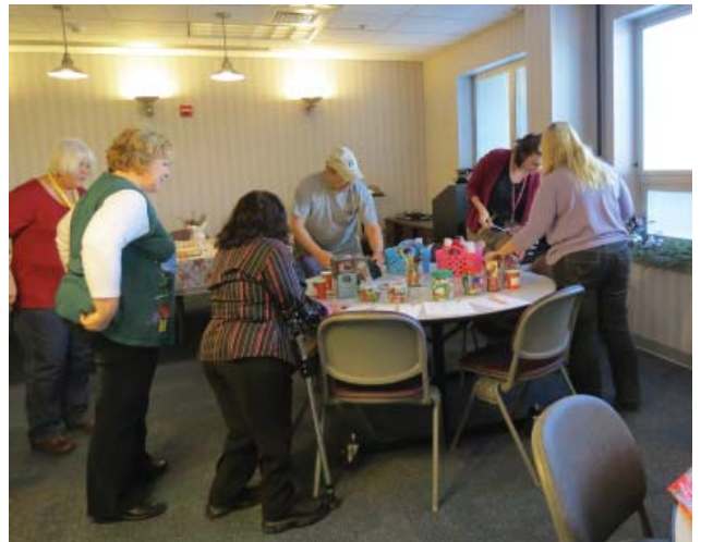
Picking where to put the door prize ticket.