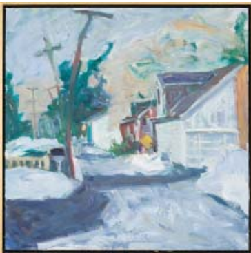
Ruth Bernard painting

Spring Art Faculty Show January 14 - February 14, 2013 Art Space - East Building - Lancaster Campus