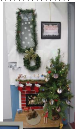
1st Place - Main 318