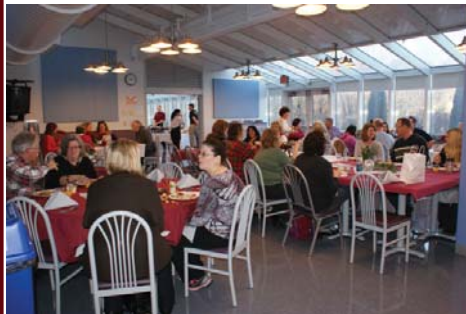
Faculty and Staff share in good conversation