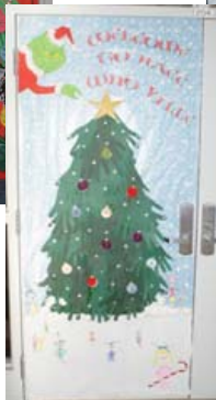
3rd Place E 204