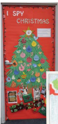
2nd Place - Library

Winners of the contest were: First place - Main 318 - Math and English departments Second place - Library Third place - East 204 - Vice President’s office