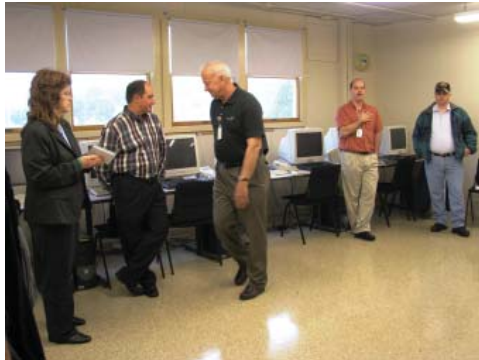
Windstream tour guides