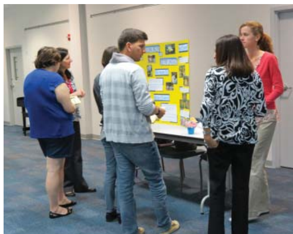
Education students discuss ESL teaching