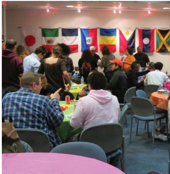
Students enjoy the ethnic food choices