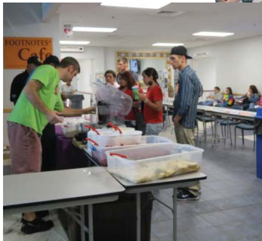
Tropical Cafe smoothies were a hit!