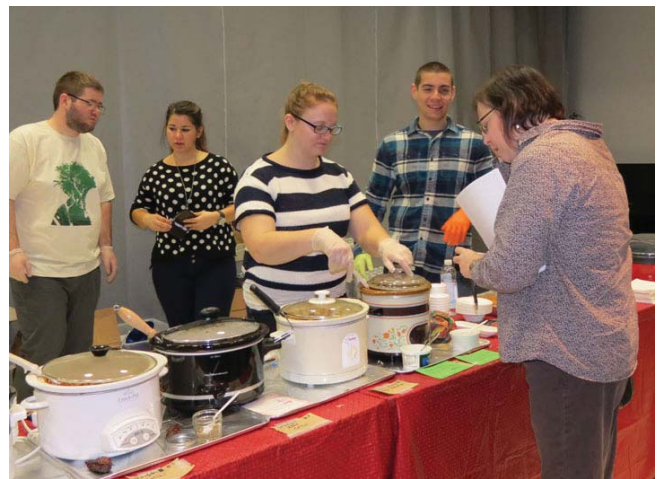
Environmental club conducted a successful chili cookoff.