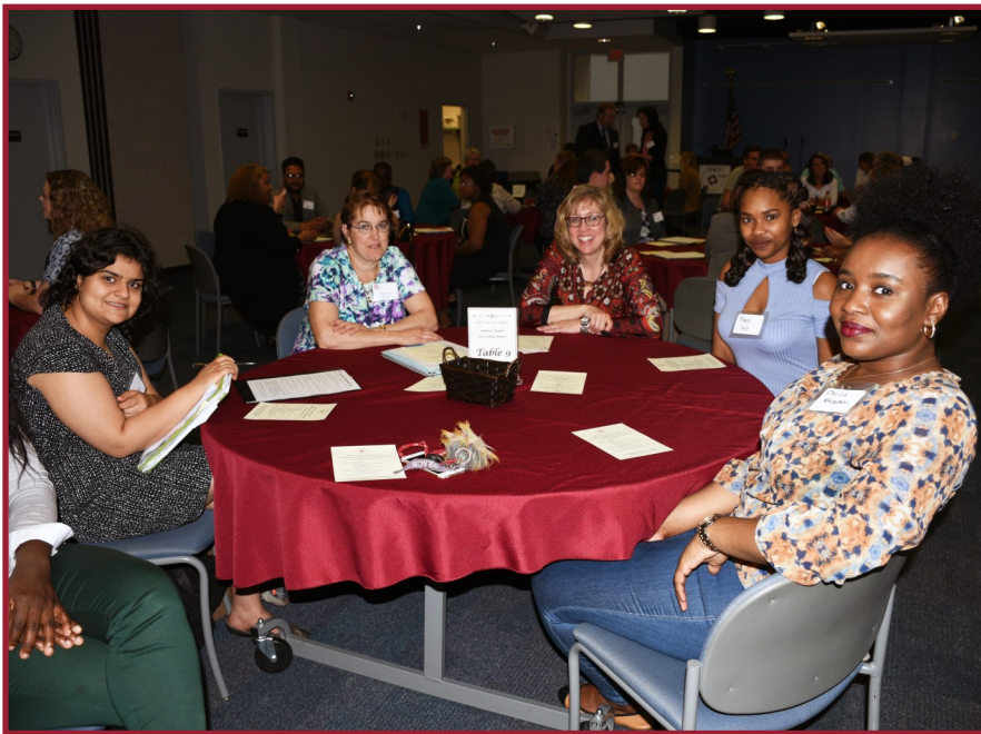
A group of students, alumni and faculty break from their conversation to get their photo taken during the networking dinner.