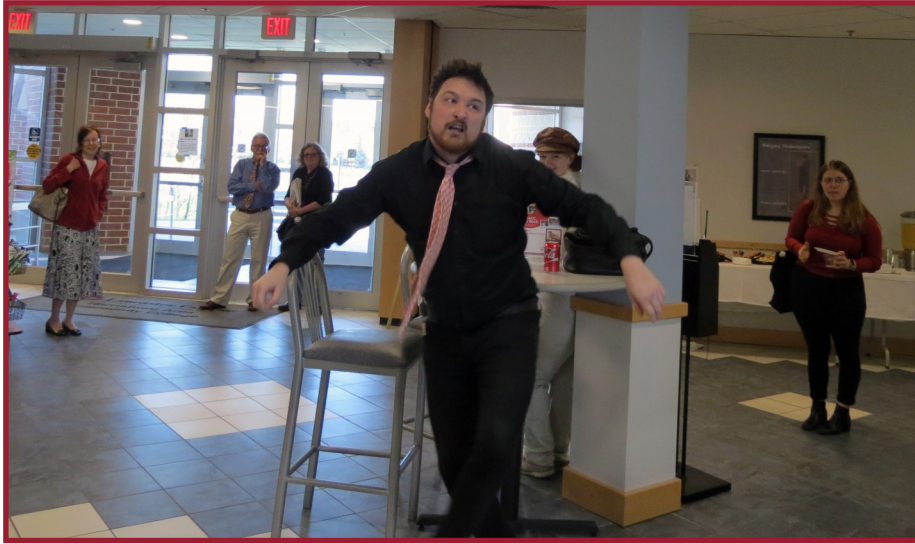
An actor from the People's Shakespeare Project, and his portrayal of the Porter in Act 2, scene 3 of Macbeth.