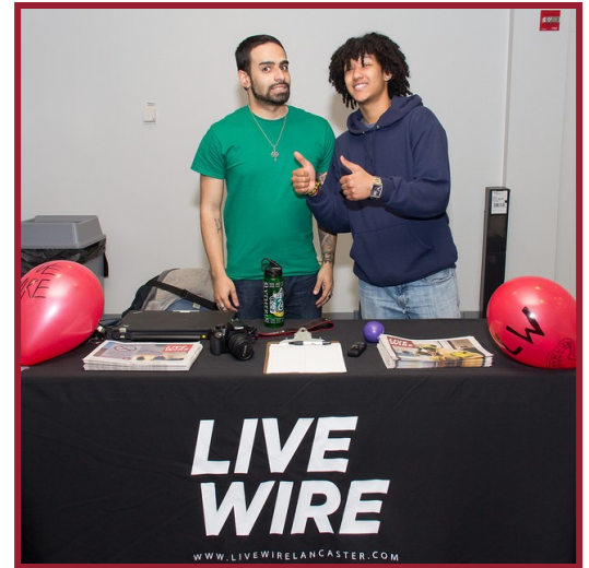
SGA sponsored a club fair on Wednesday, Feb. 8, 2017, in which HACC Lancaster Campus student clubs were represented.