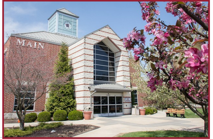
Springtime photos of the Main Building at HACC's Lancaster Campus.