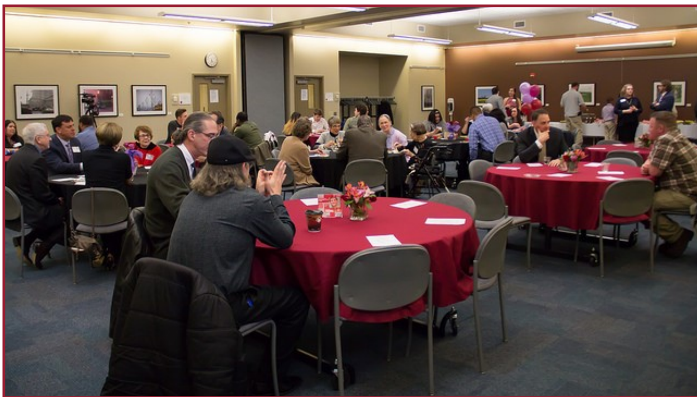
Donor, student and faculty participants network during the pre-program Donor & Student Recognition Reception.