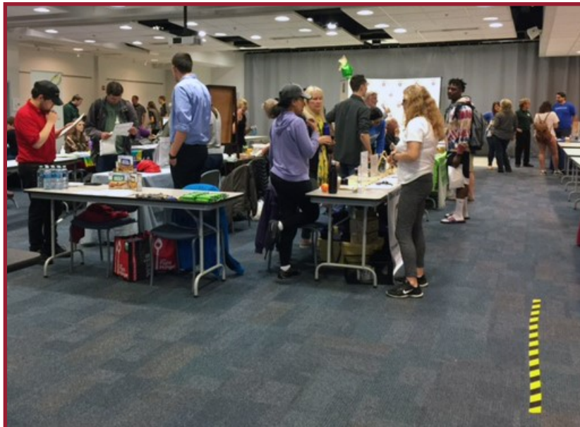
Over 20 vendors were present for the Health and Wellness Fair on Wednesday, Apr. 26, 2017, with over 100 visitors attending the event.