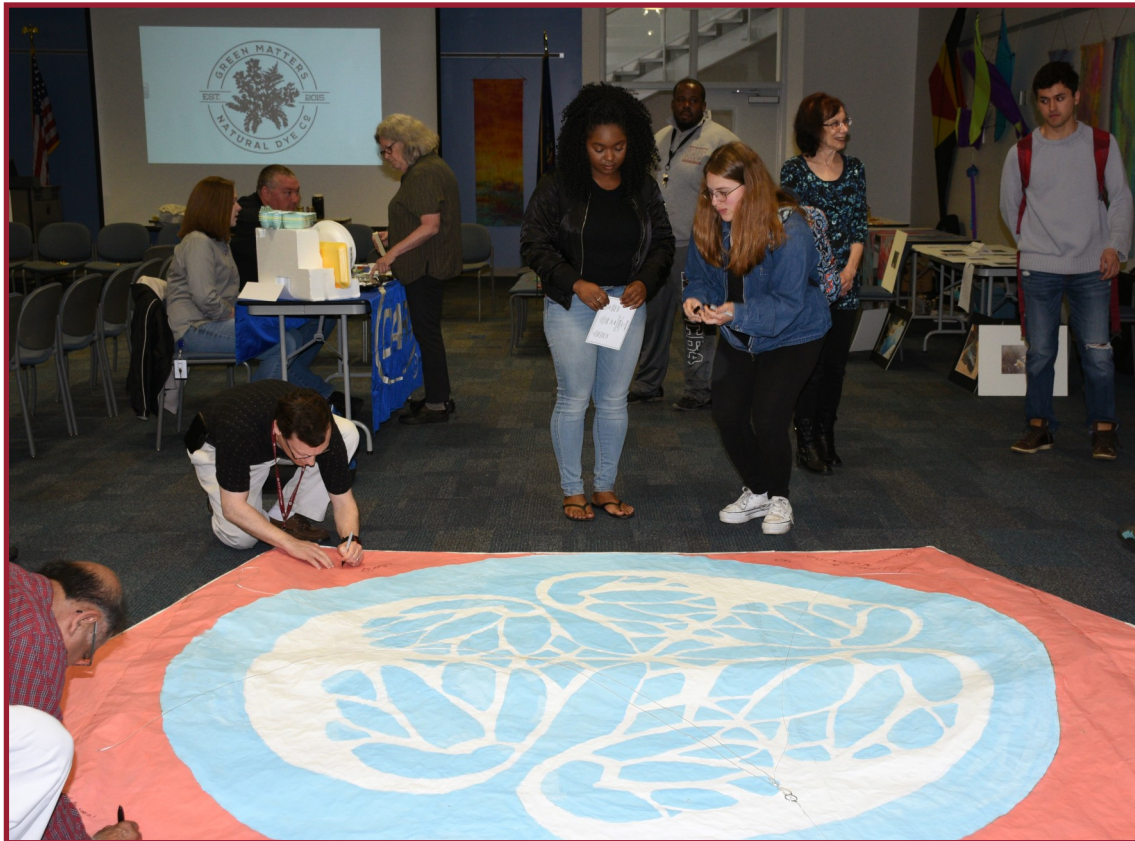
Earth Day was celebrated at the Lancaster Campus on Monday, Apr. 24, 2017. Part of the festivities included a huge kite that students, faculty and staff were asked to sign.