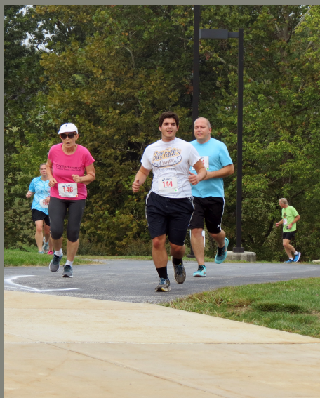
Runners of all ages enjoyed the beautiful scenery of the Lancaster Campus trail.