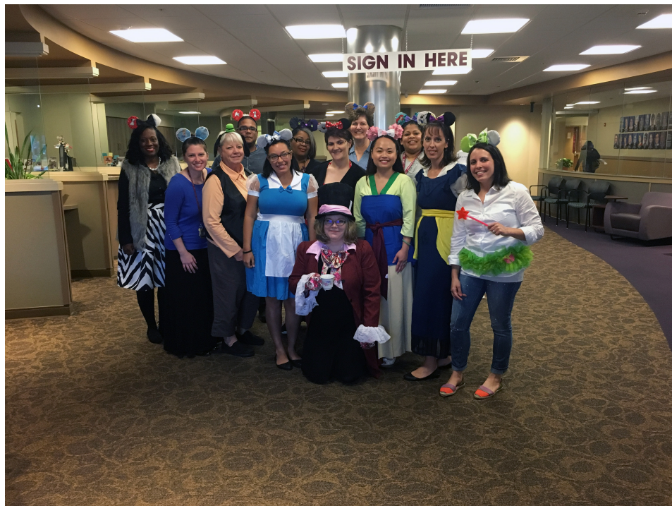
Student Affairs staff members take the prize for best themed costumes! Can you guess the theme?