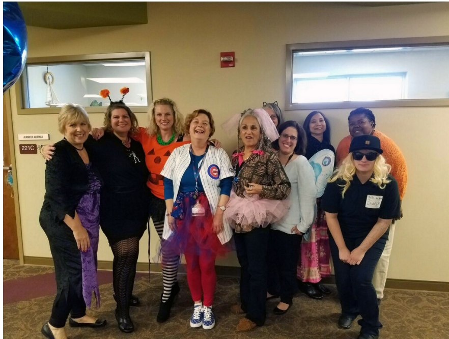
A few Lancaster Campus Counseling & Advising staff members took part in a Halloween dress-up on Monday, Oct. 31st.