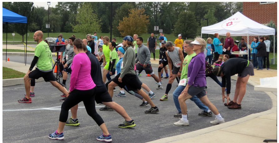
Runners line up at the starting line to stretch before the run.